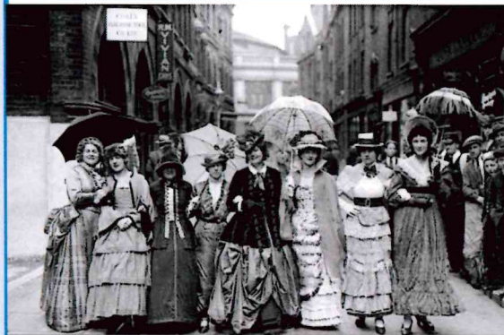
Ladies Bible Study